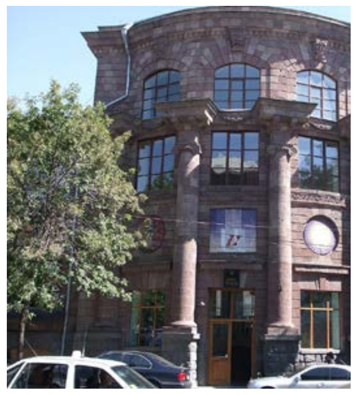
National Library of Armenia

When the COVID-19 virus emerged as a worldwide pandemic, libraries were forced to make immediate decisions. By mid-March, libraries in the region had started